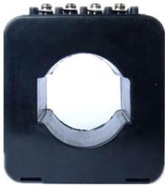
A)solid core type

*No danger from open-circuited secondary *Not damaged by large overloads